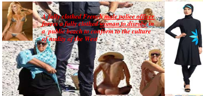
A fully clothed French male police officer forces a fully clothed woman to disrobe in a public beach to conform to the culture of nudity of the West.

When bikini was introduced in 1940s and the Vatican declared it sinful, some European Countries (= the European Taliban) and several US states banned women from wearing the immoral and sinful bikini on the beaches. The popular hooded wetsuit 2 is called burkini, veilkini, azadkini etc. when the female wearer is a Muslim.